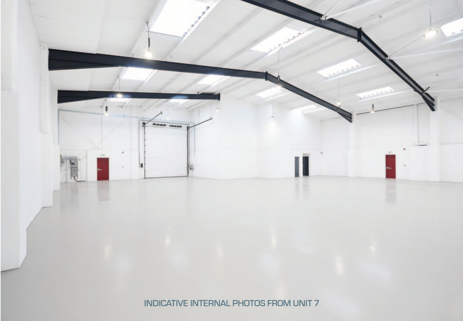
INDICATIVE INTERNAL PHOTOS FROM UNIT 7