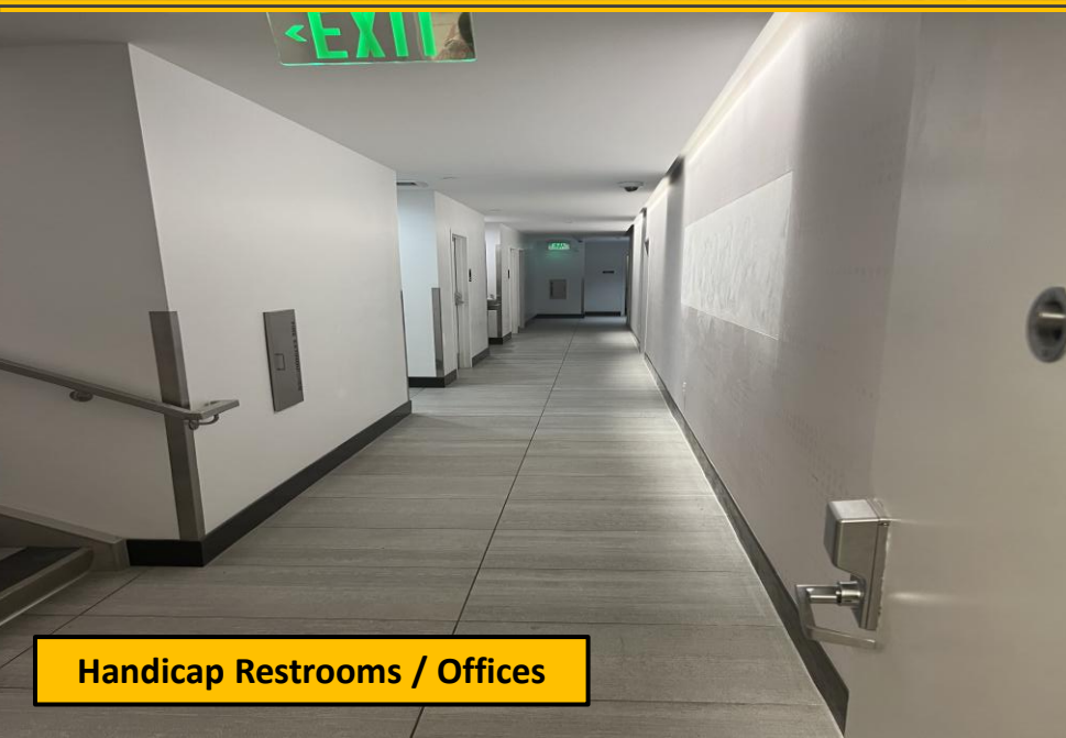
Handicap Restrooms / Offices