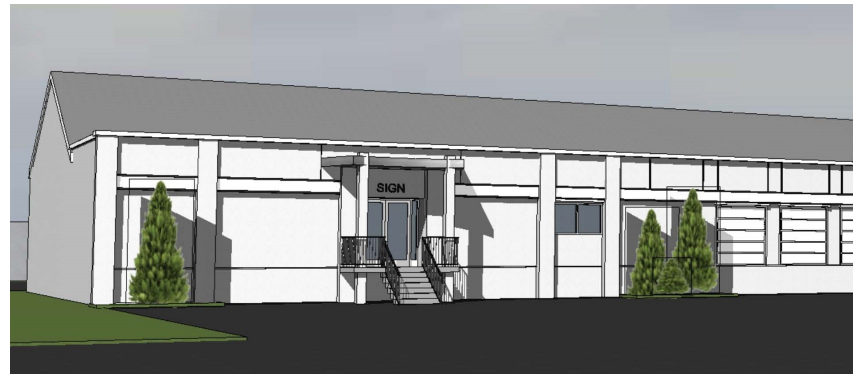
Private Entrance and 2 Dock Doors