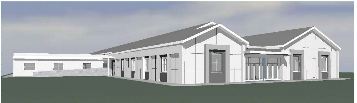
Front of Building Facing East Main Street