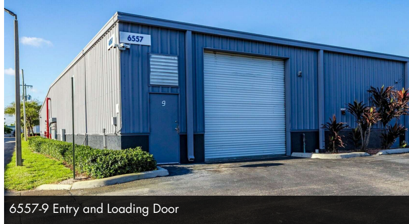
6557-9 Entry and Loading Door