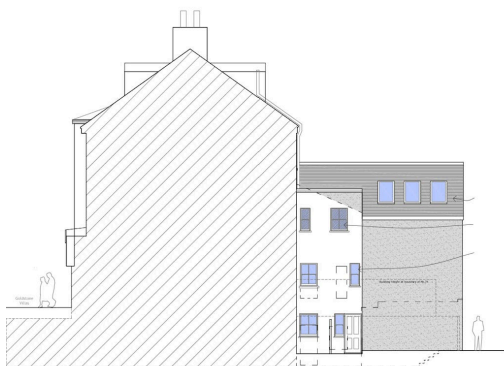
Section/ Side (North) Elevation

Please note measurements scaled from plans. All plans/ pictures are indicative and subject to change.