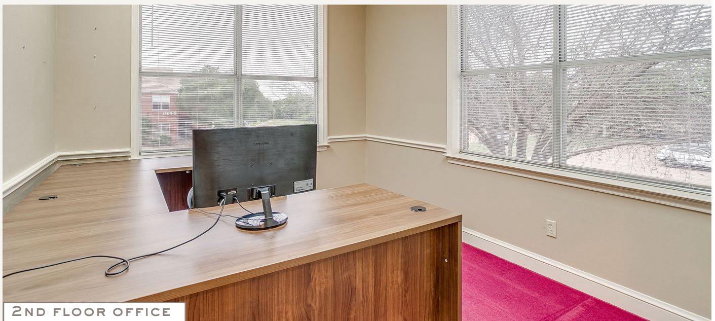
2ND FLOOR OFFICE