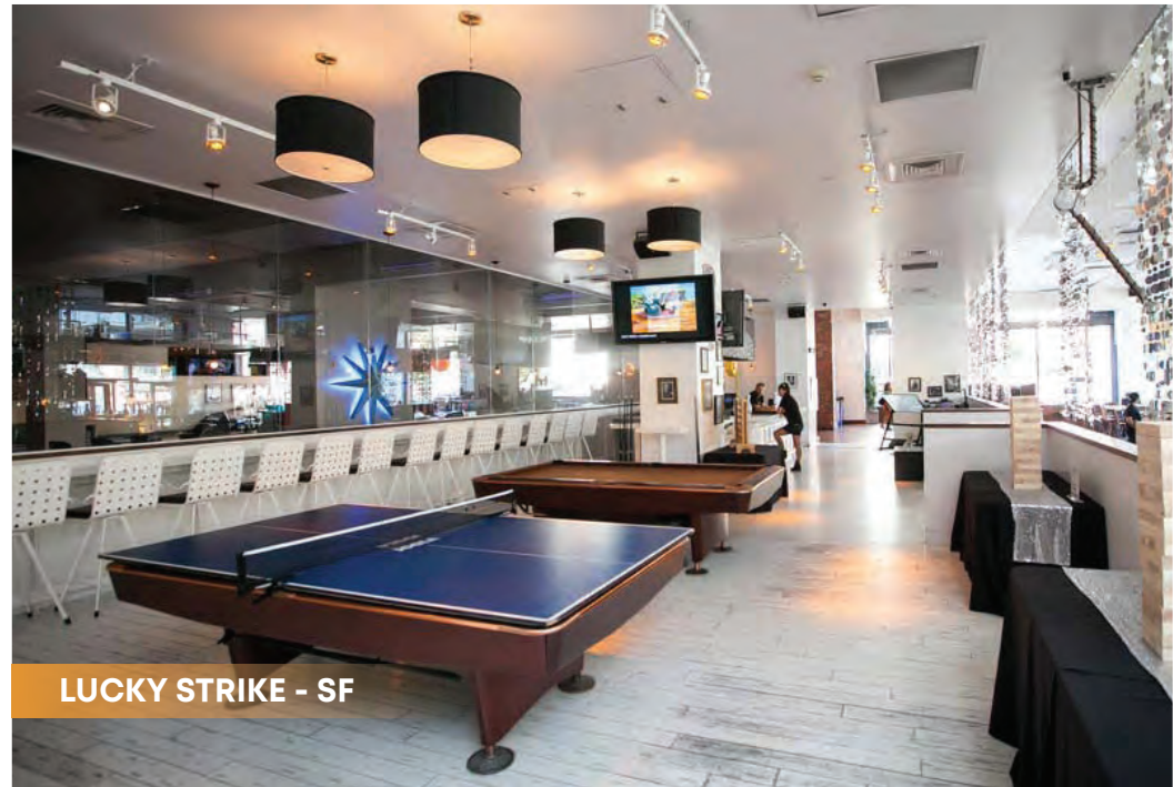
LUCKY STRIKE - SF