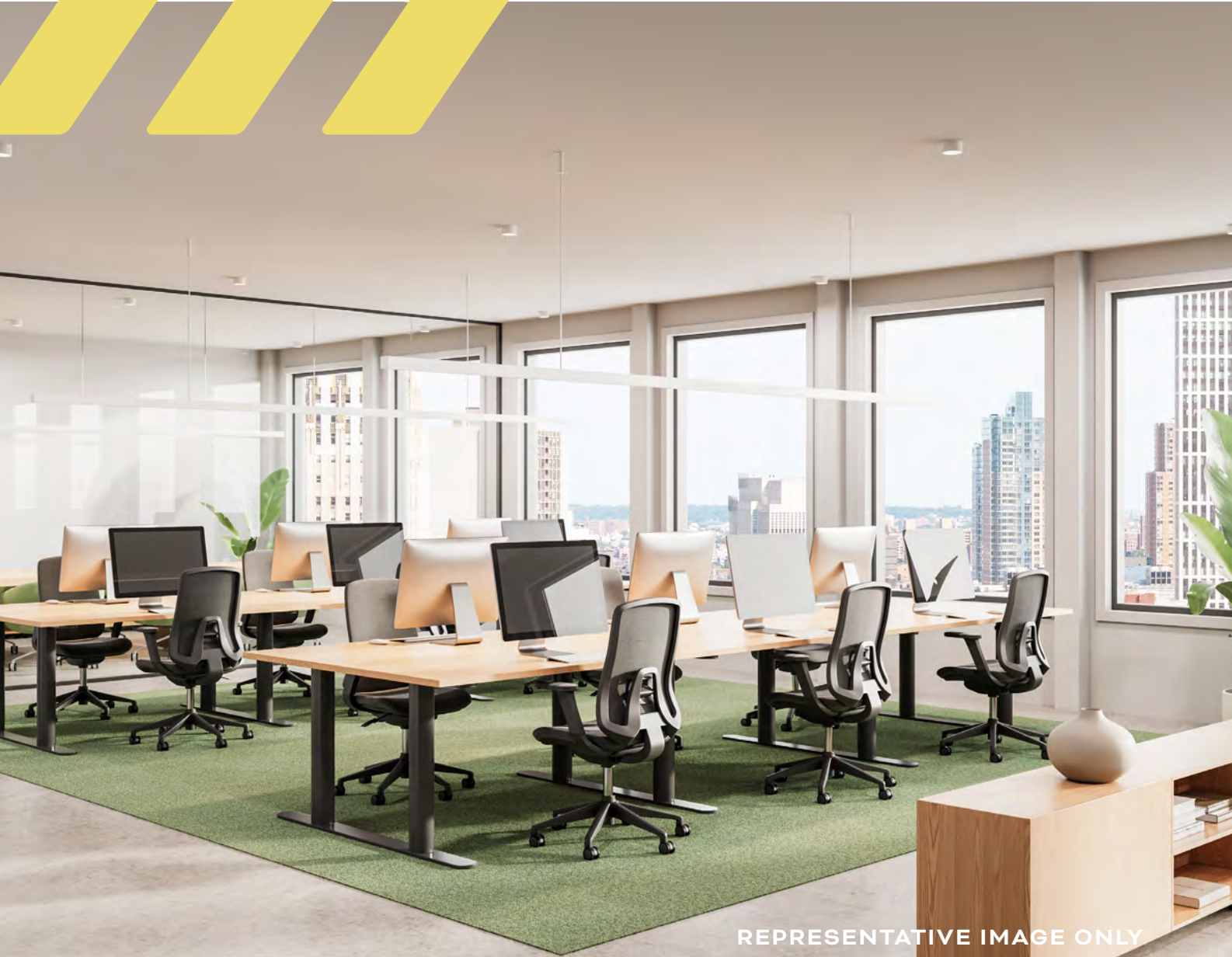
REPRESENTATIVE IMAGE ONLY