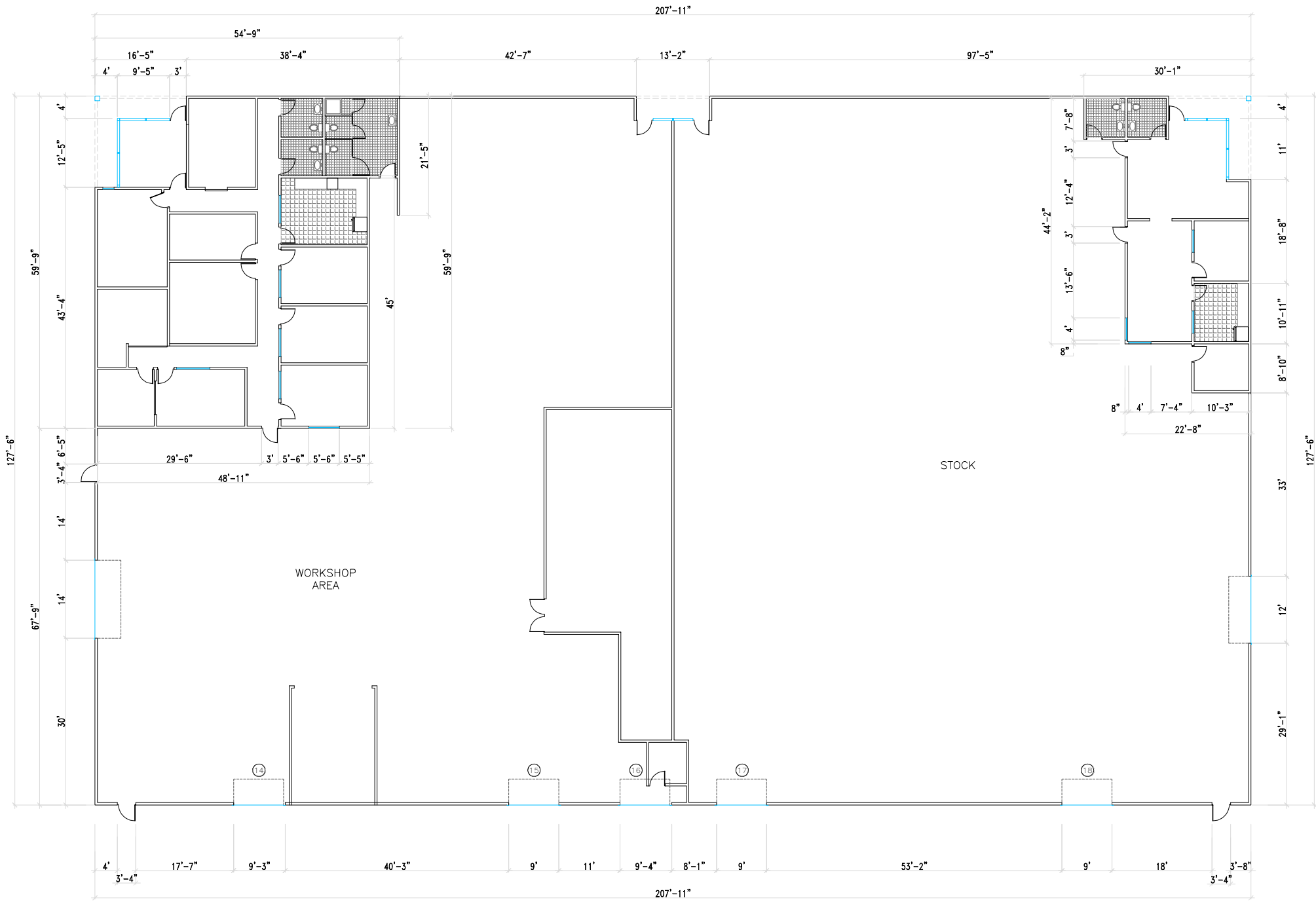
2 BUILDING NO.4971 OVERALL FLOOR PLAN