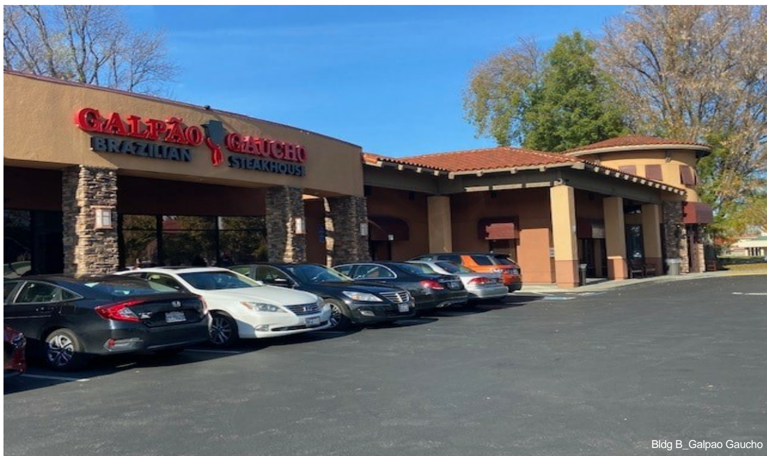
Bldg B_Galpao Gaucho