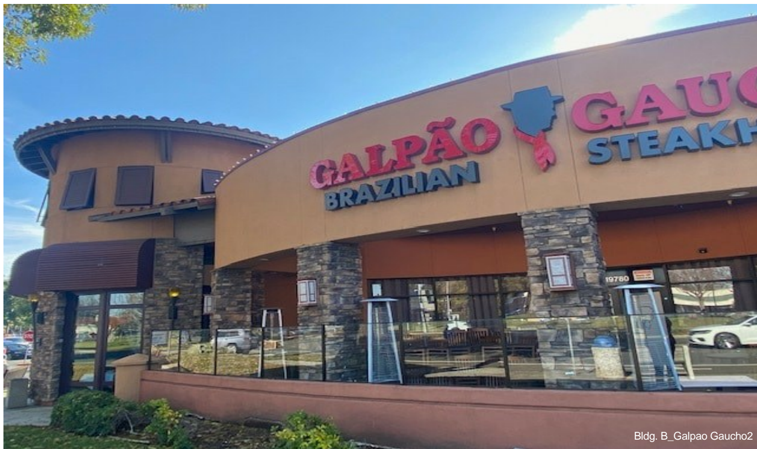
Bldg. B_Galpao Gaucho2