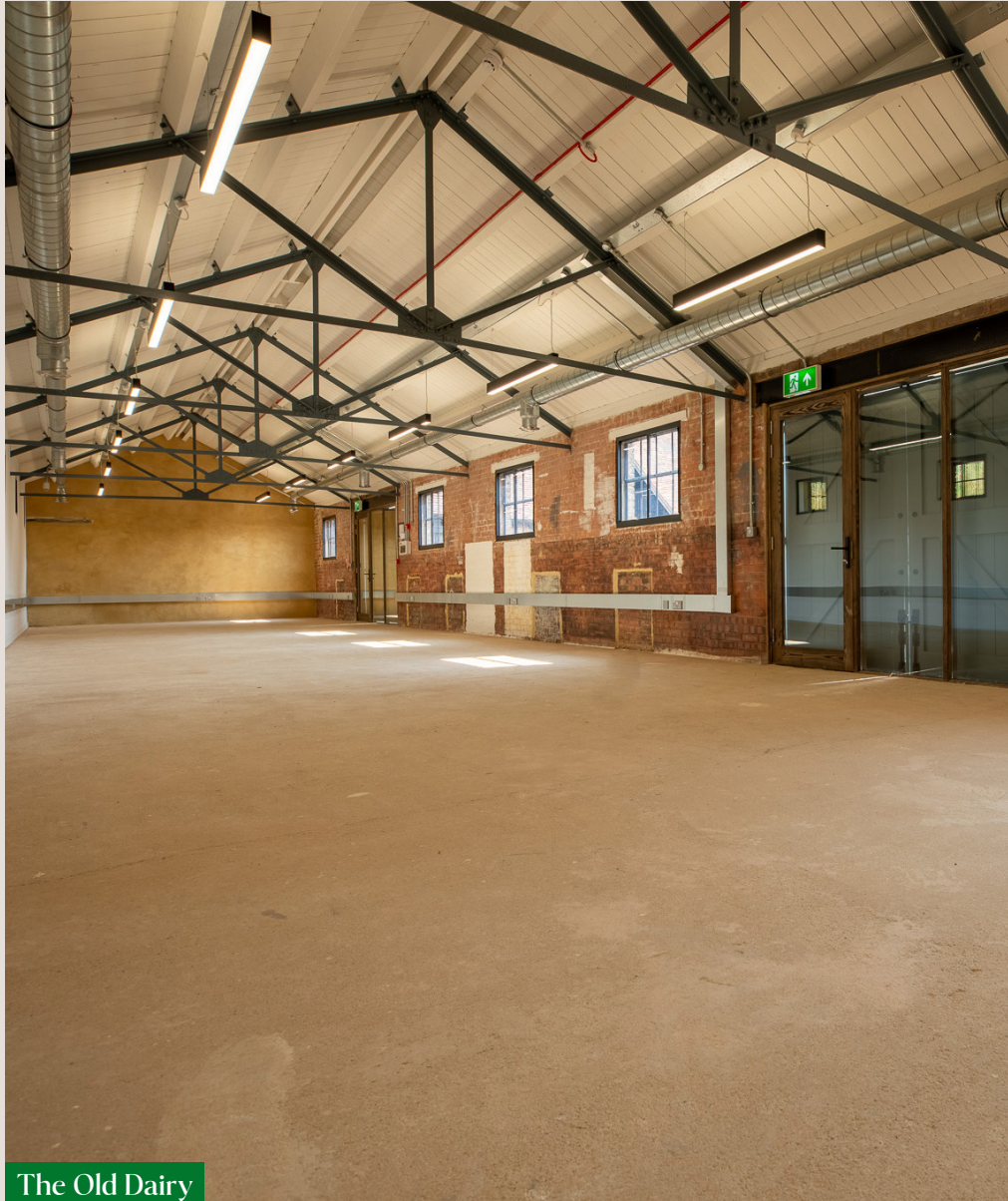
The Old Dairy