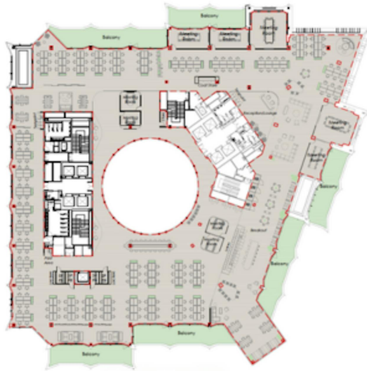
6th Floor Space Plan