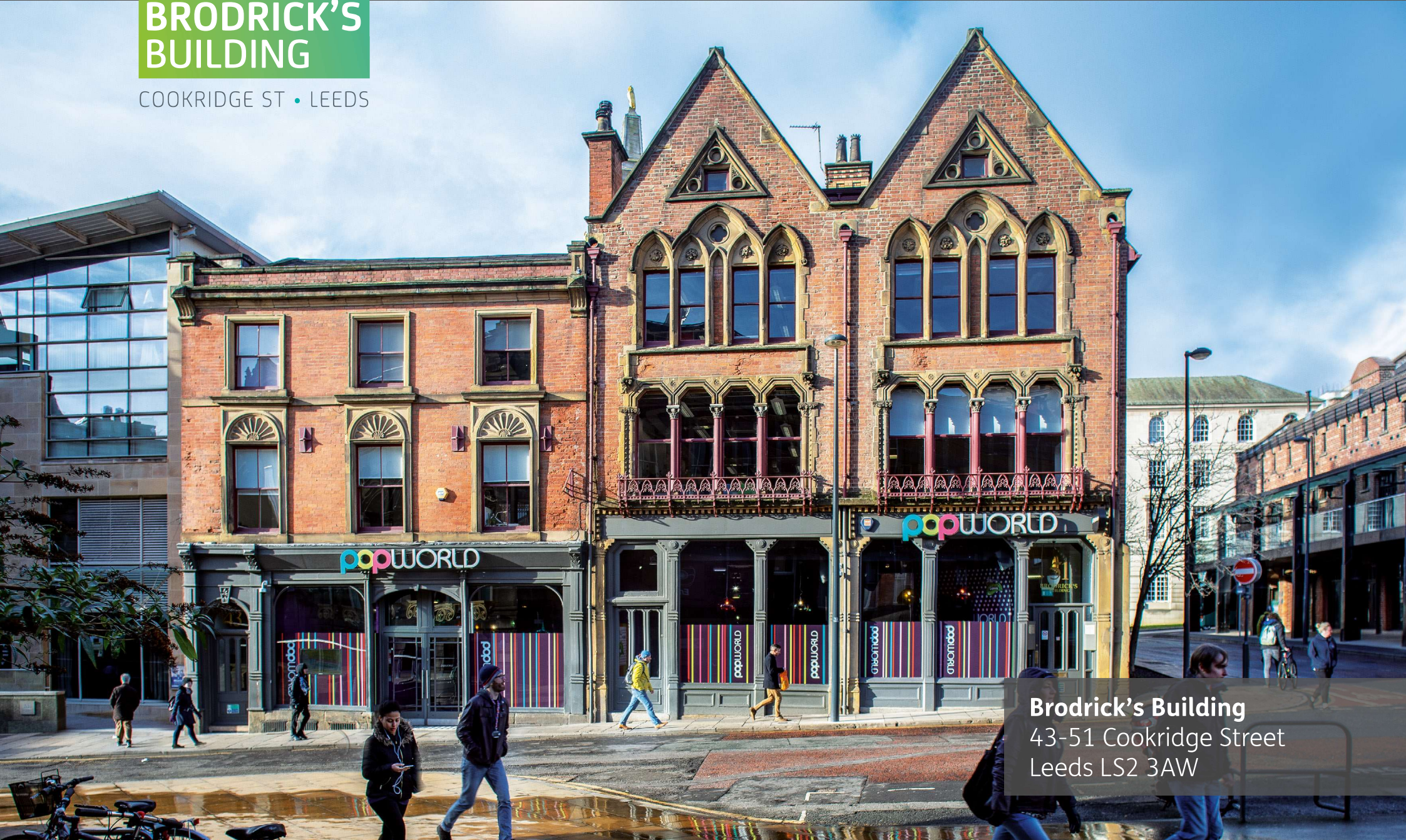
Brodrick's Building 43-51 Cookridge Street Leeds LS2 3AW