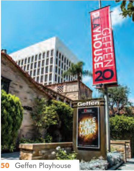
50 Geffen Playhouse