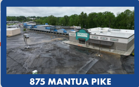
875 MANTUA PIKE