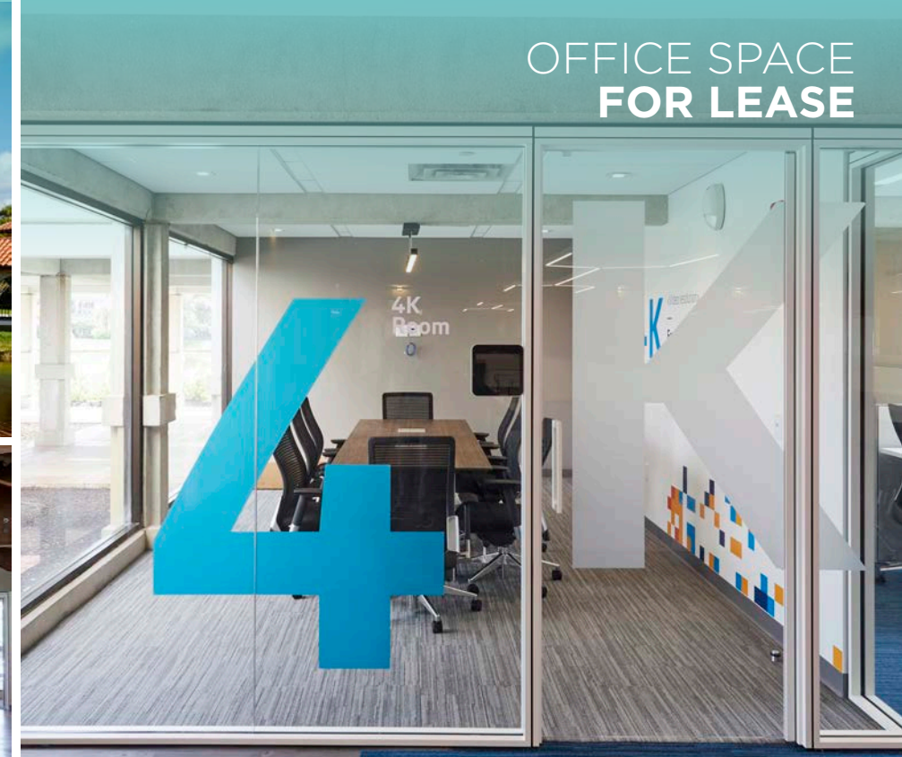
PREMIER SAWGRASS LOCATION