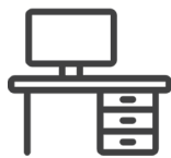
2 Private offices