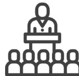
5 Conference rooms