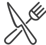
Kitchen / Break Area