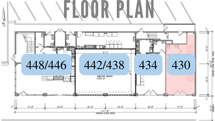
430 - 448 BEACH ST., S.F. 1ST FLOOR - AREAS 10'11" x 11'11"