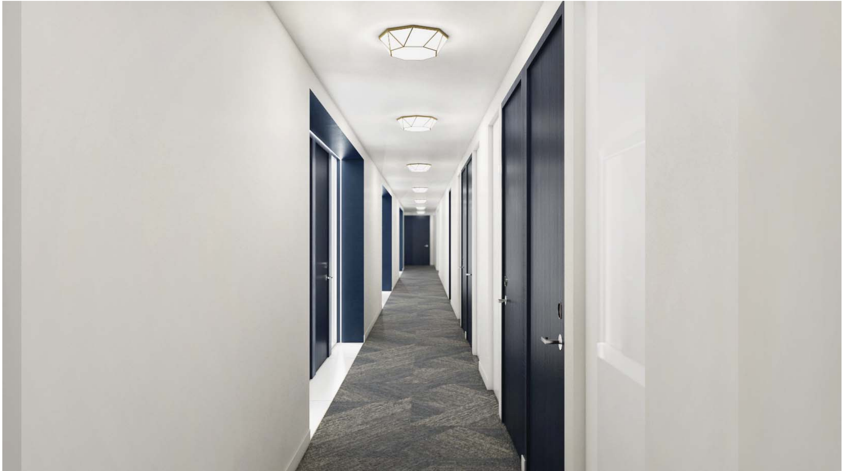
TYPICAL CORRIDOR RENDERING