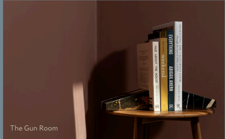
The Gun Room

Each room has integrated ClickShare video-conferencing and HD screens, as well as bespoke design touches and natural light.