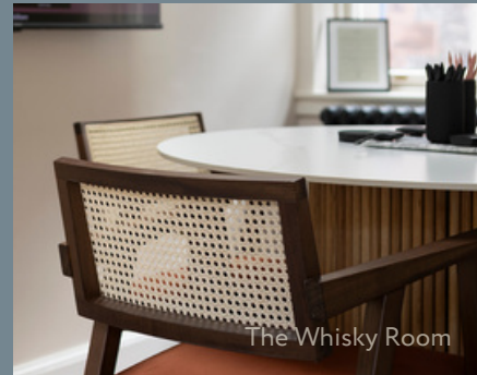
The Whisky Room