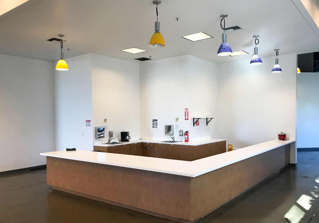
POLISHED CONCRETE FLOOR