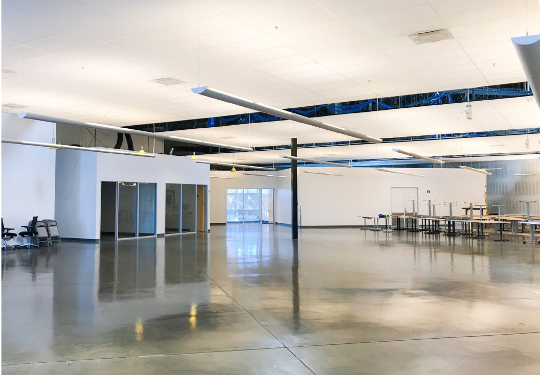
HIGH CEILINGS & OPEN PRODUCTION AREA