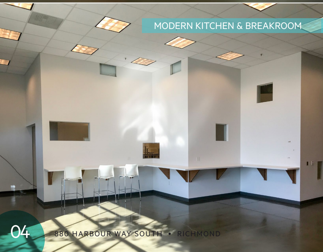
MODERN KITCHEN & BREAKROOM