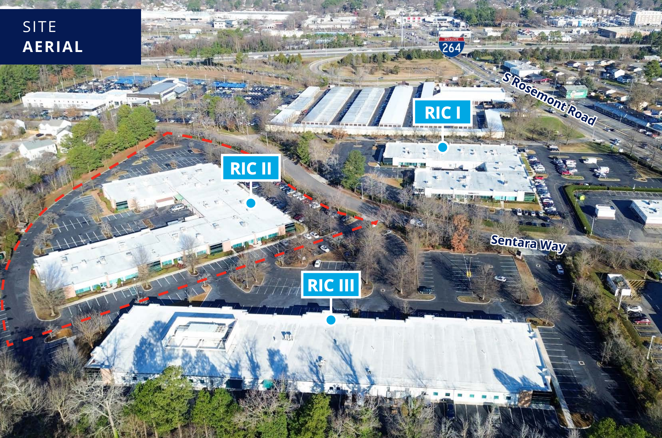
Rosemont Interstate Center | 3637 Sentara Way, Virginia Beach, VA