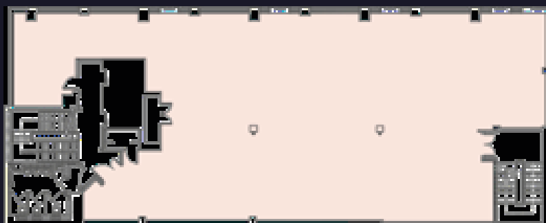
Indicative Floor Plate