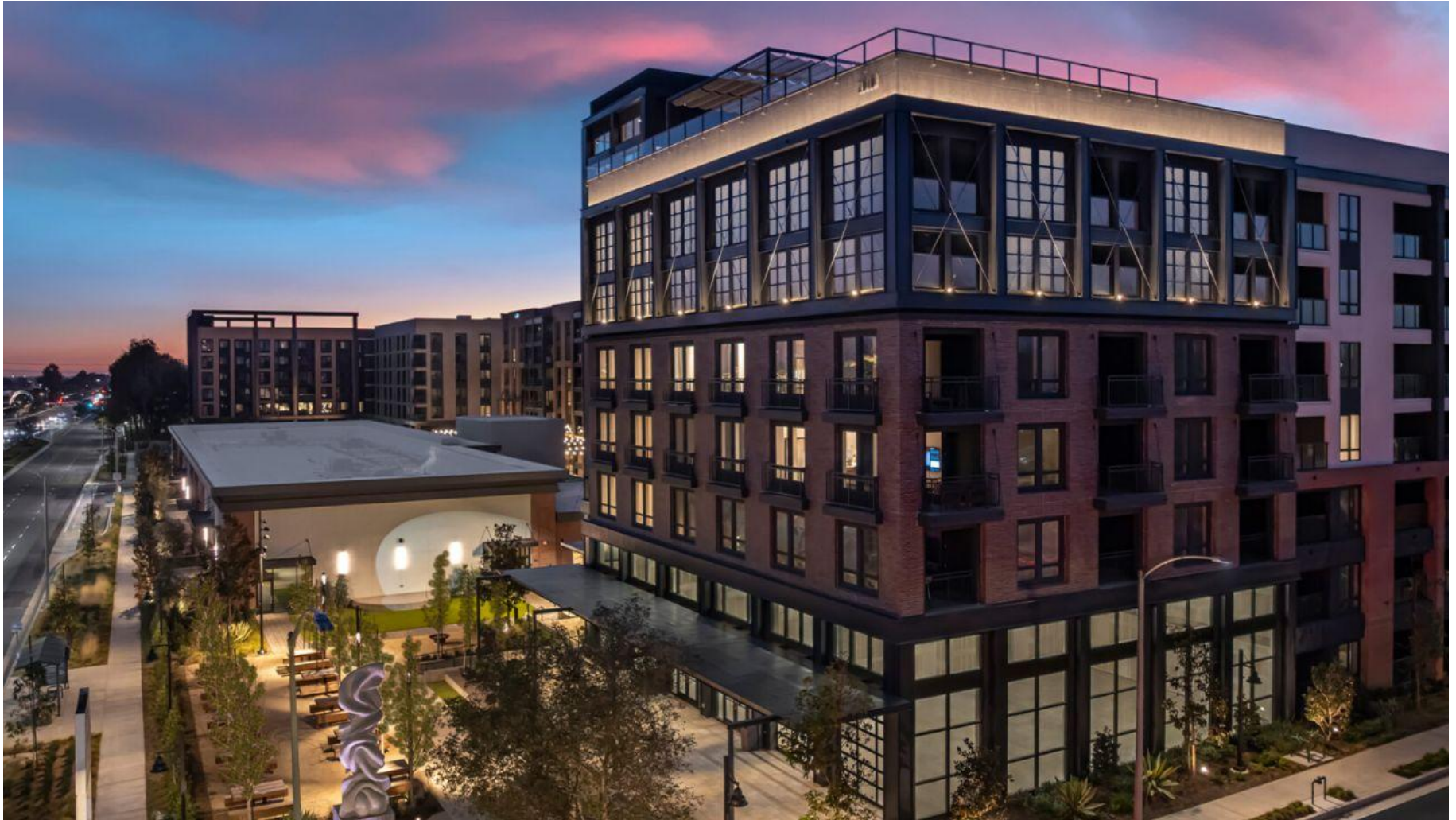
40,000 SF Retail for Lease at the corner of Red Hill and Warner Avenues in Orange County