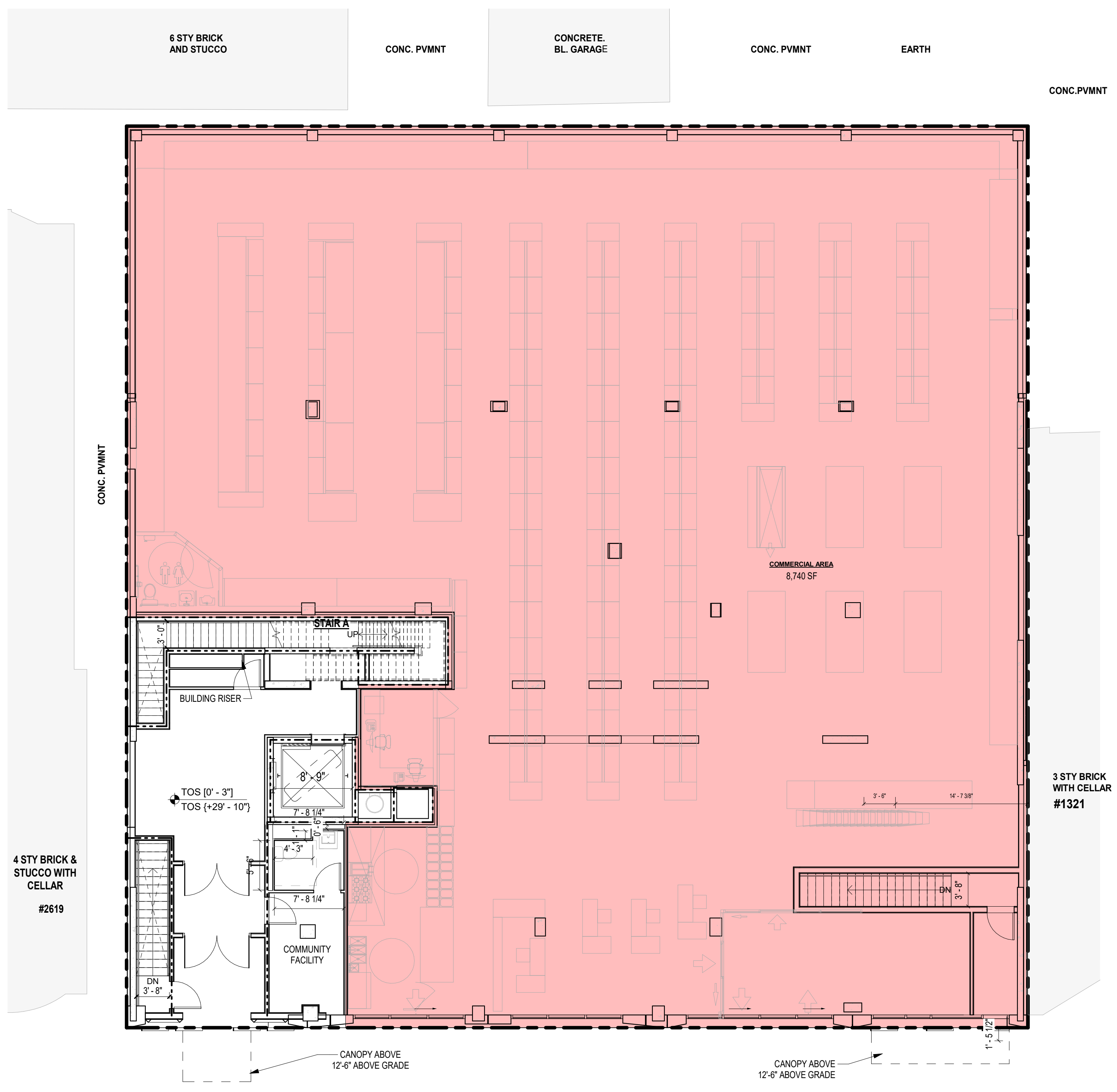
2 1ST FL PLAN 1/8" = 1'-0"