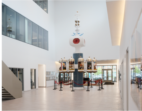
HOME TO ROCHESTER LANDMARK: THE CLOCK OF NATIONS