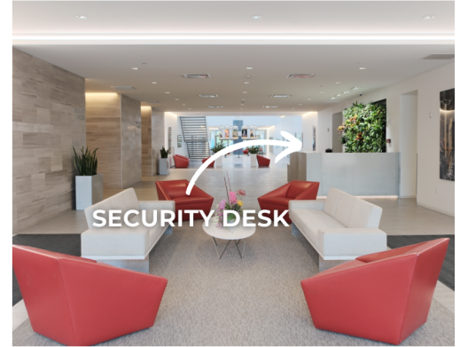
24/7 SECURITY IN LOBBY