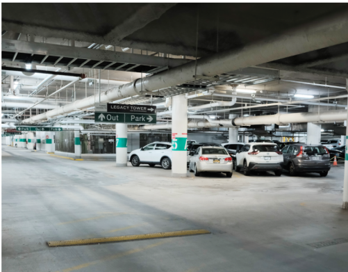
ON-SITE PARKING GARAGE WITH DIRECT ELEVATOR ACCESS