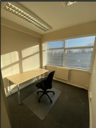
Indicative photos of suites