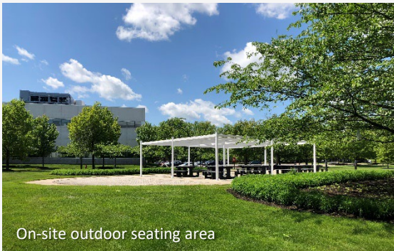
On-site outdoor seating area

Our prestigious tenants include: AIM Immunotech, Ascendia, Boehringer Ingelheim, Doehler, Genomic Prediction, miR Scientific and Rutgers University.