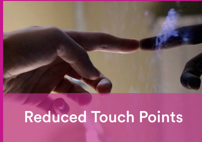
Reduced Touch Points