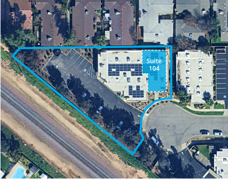
Floor Plan Not to Scale