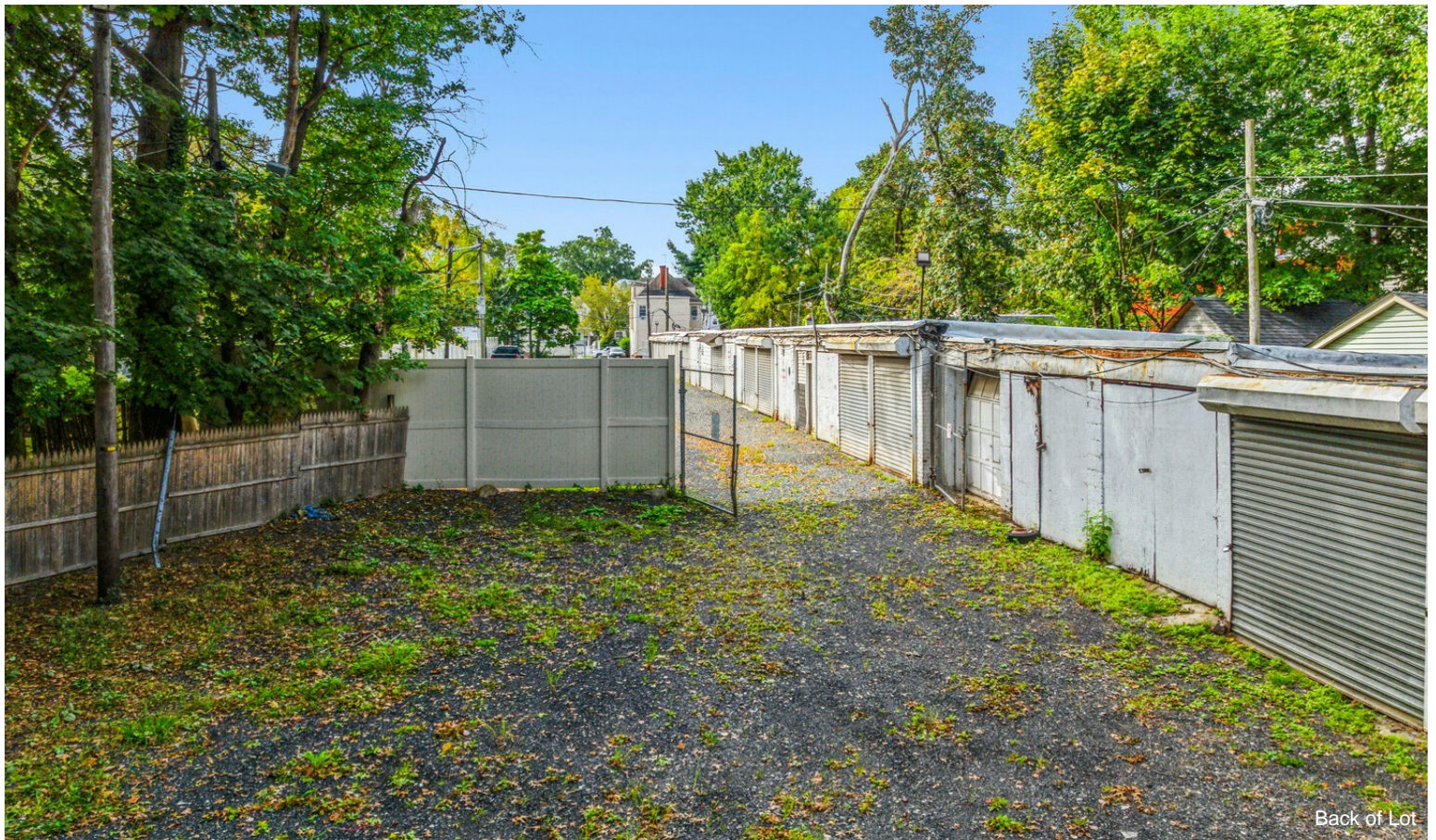
Back of Lot