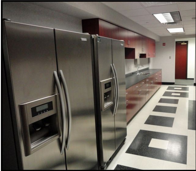
Break Room- Kitchen