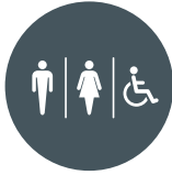
MALE, FEMALE & DISABLED WC'S