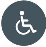
FULLY DDA COMPLIANT