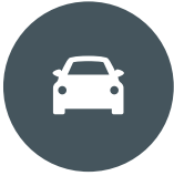
EXCELLENT PARKING RATIO OF 1:241 SQ FT