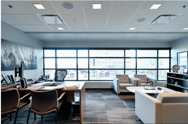
Executive Office / Meeting Room