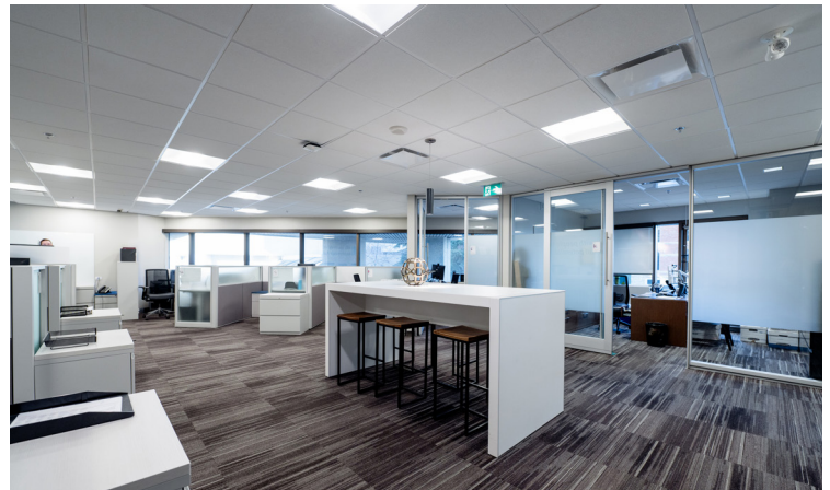
Open Work Area