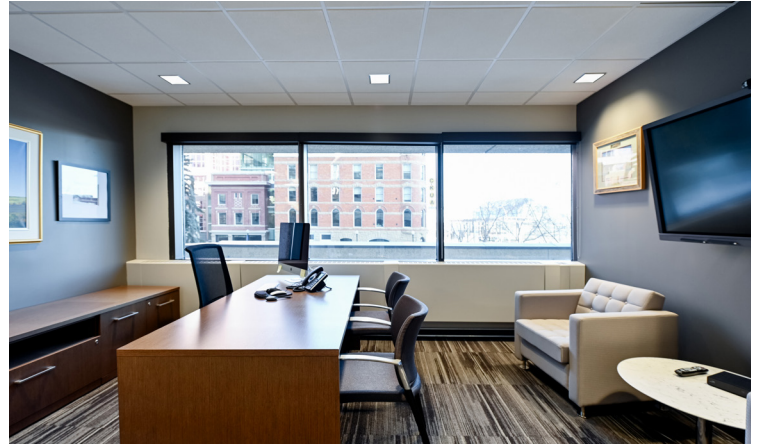
Executive Office / Meeting Room