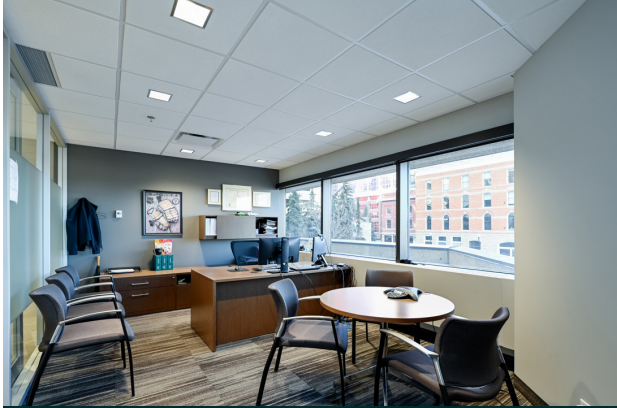
Executive Office / Meeting Room