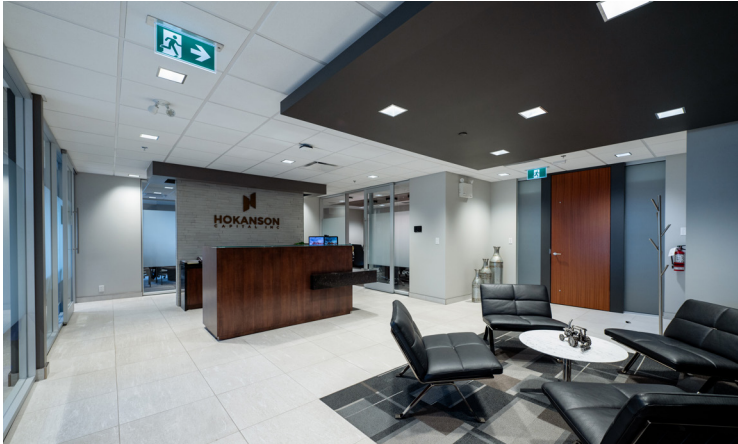
Reception & Waiting Area

Suite 200, 9888 Jasper Avenue | Edmonton, AB