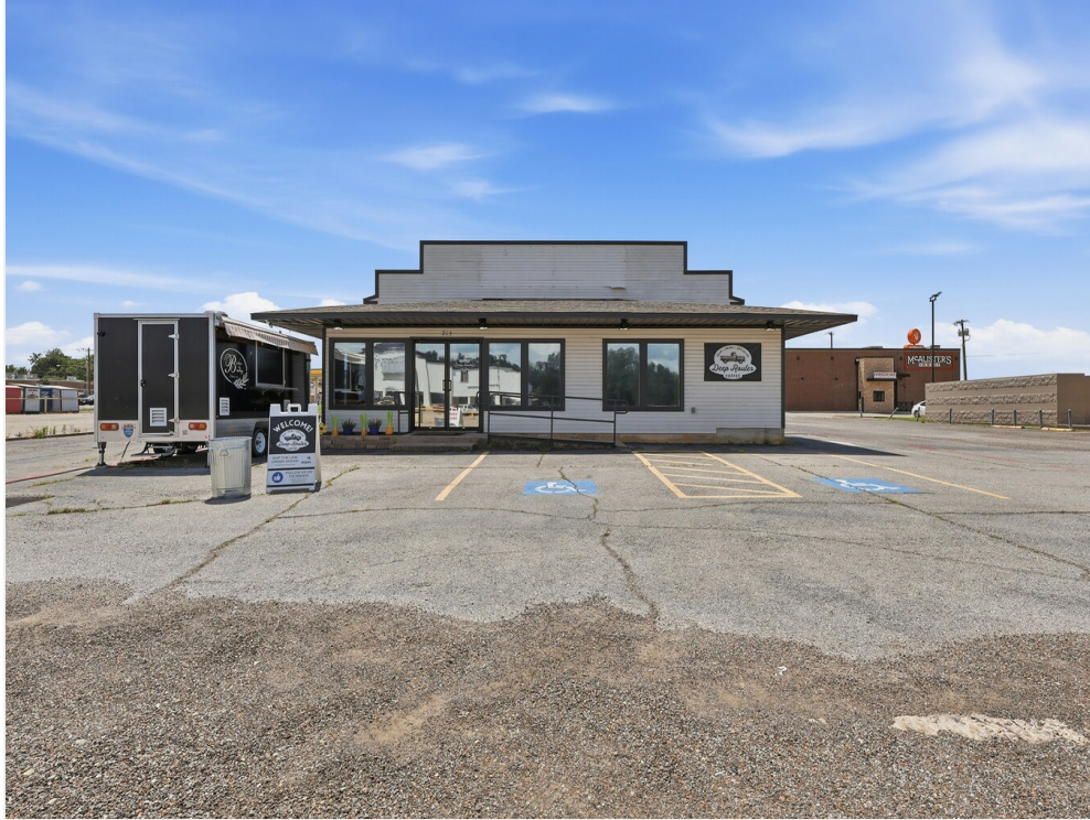
Retail - Office