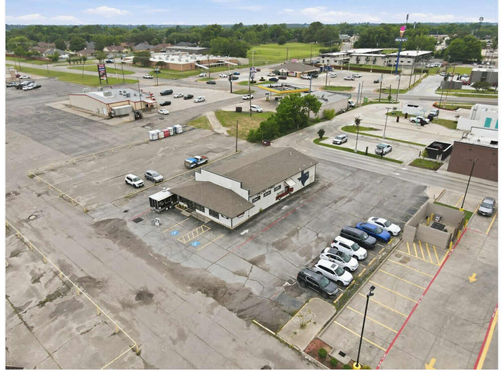
Free Standing & Plenty of Parking