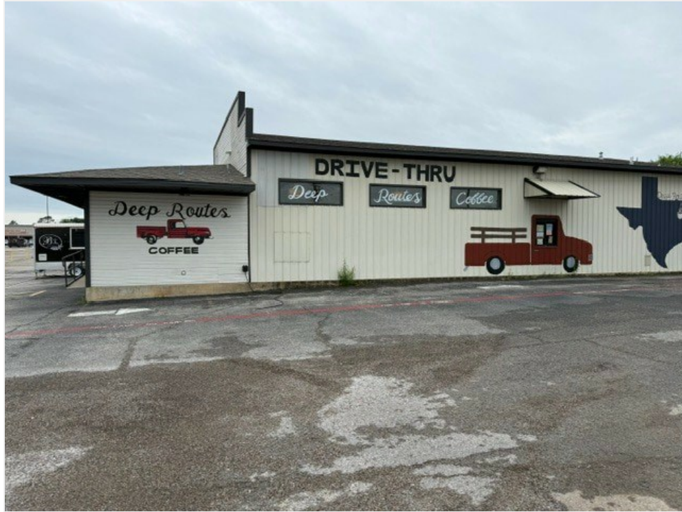
Drive Thru window