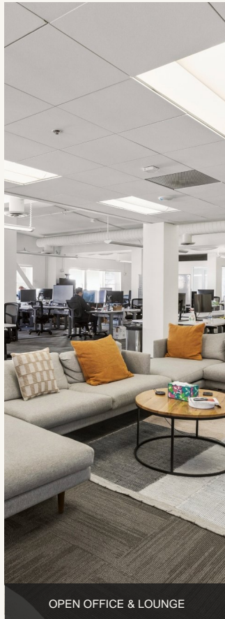
OPEN OFFICE & LOUNGE