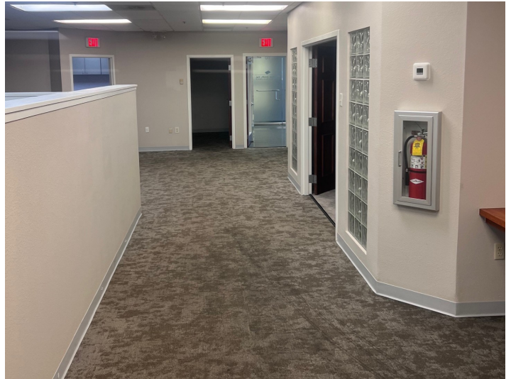
Suite 110, 1st Floor - 2,675 SF - 22/SF/YR