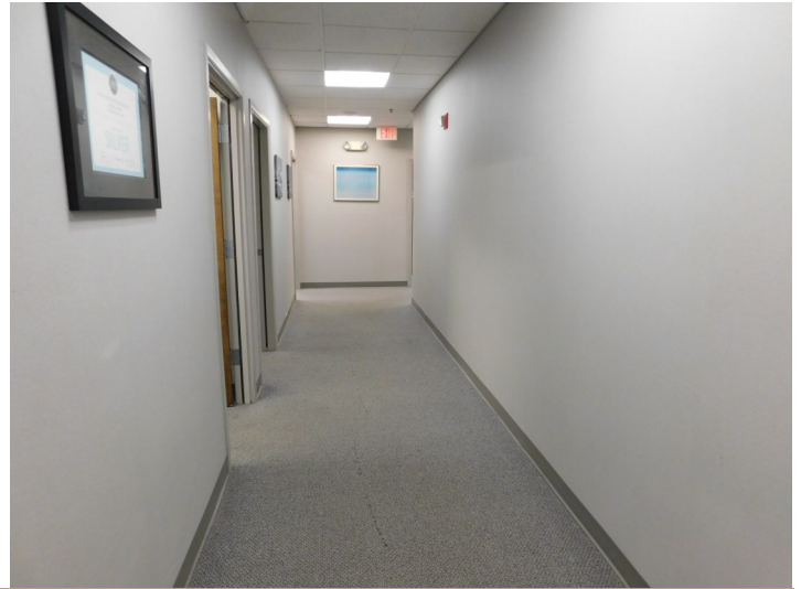
Suite 230B, 2nd Floor - 4,813 SF - $18/SF/YR