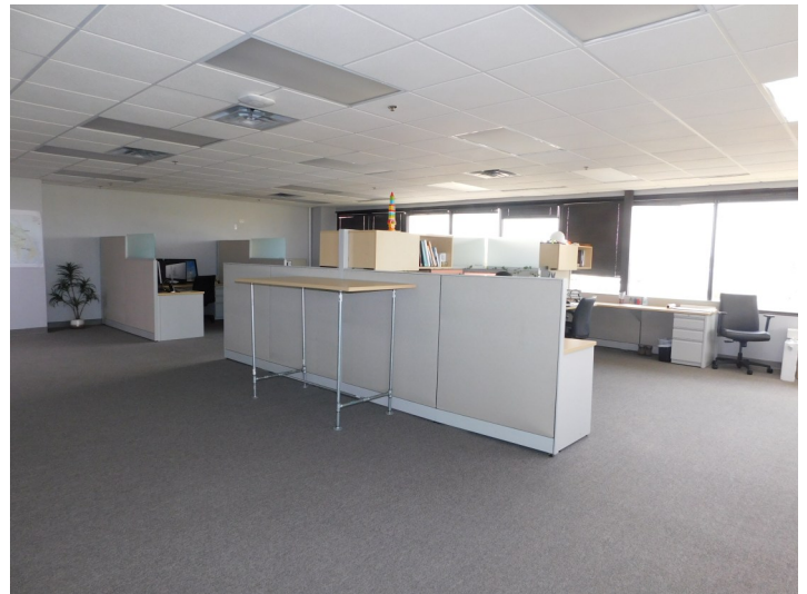
Suite 310, 3rd Floor - 3,874 SF (Blue Area) - $22/SF/YR