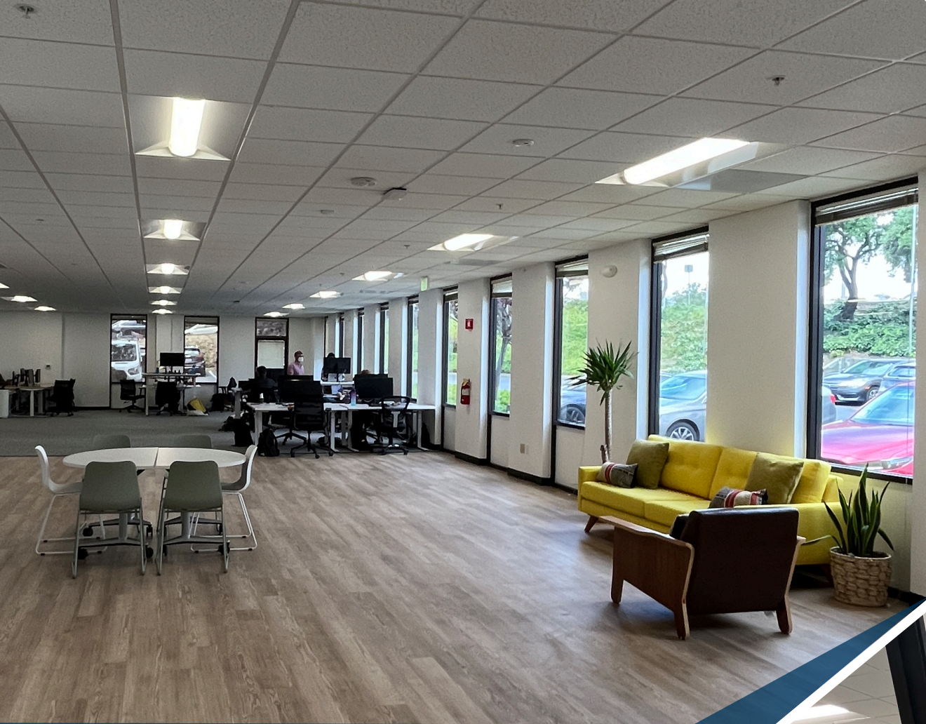
OPEN OFFICE AREA