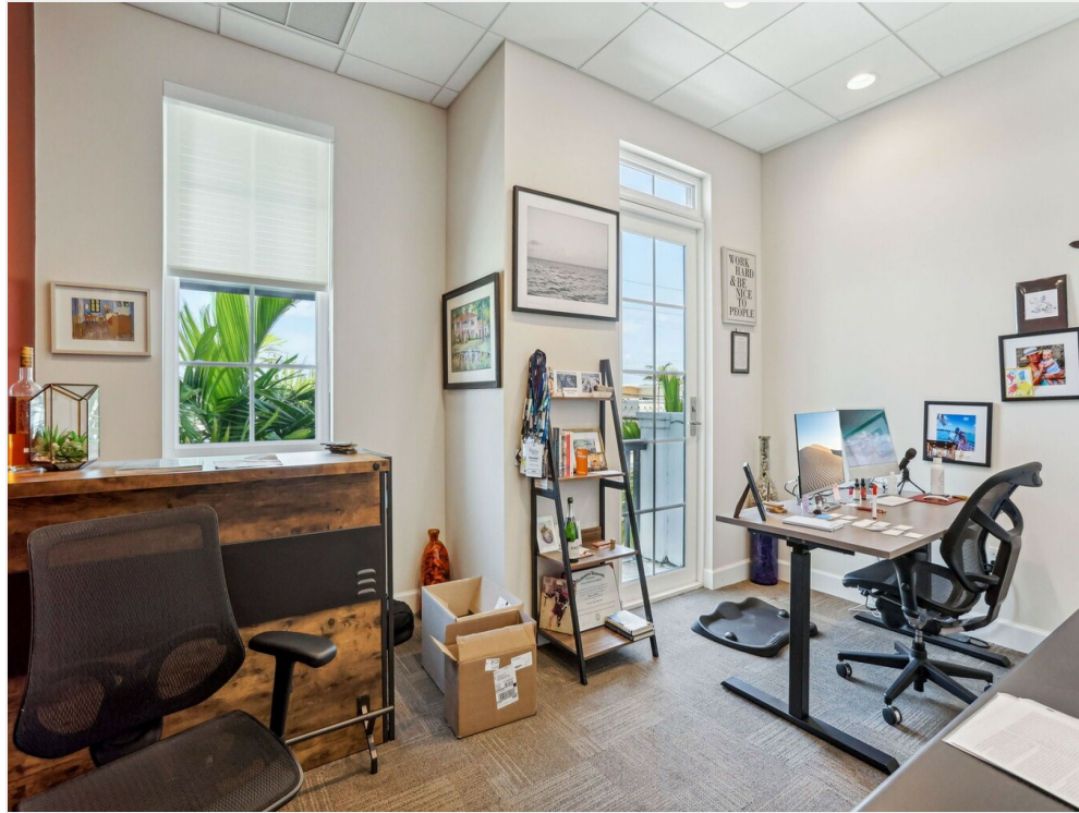
Office with Balcony