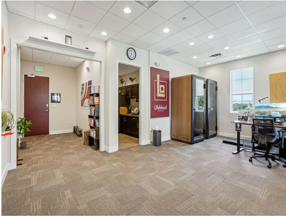
Open area and view of front door and break room