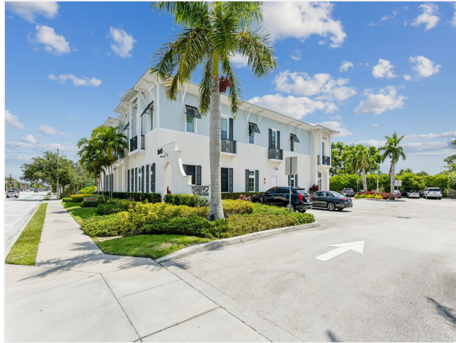
Outside picture from Southside

2645 N Federal Hwy, Delray Beach, FL 33483