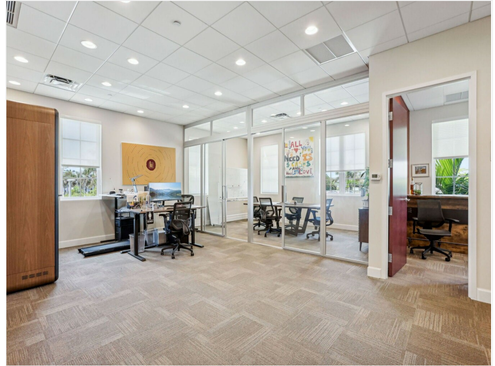
Open Office area