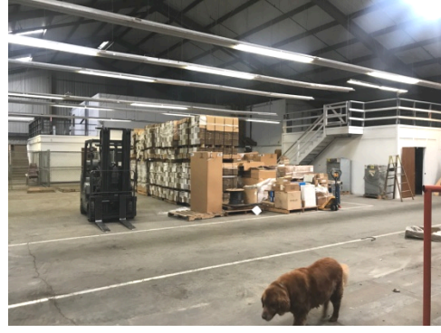
Wide Open, 100' clear span