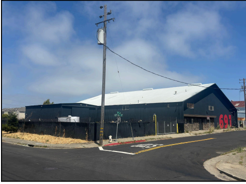
New Reflective Roof