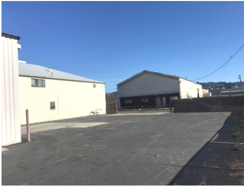
Secure Paved Yard