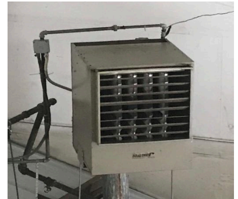
Gas Space Heaters