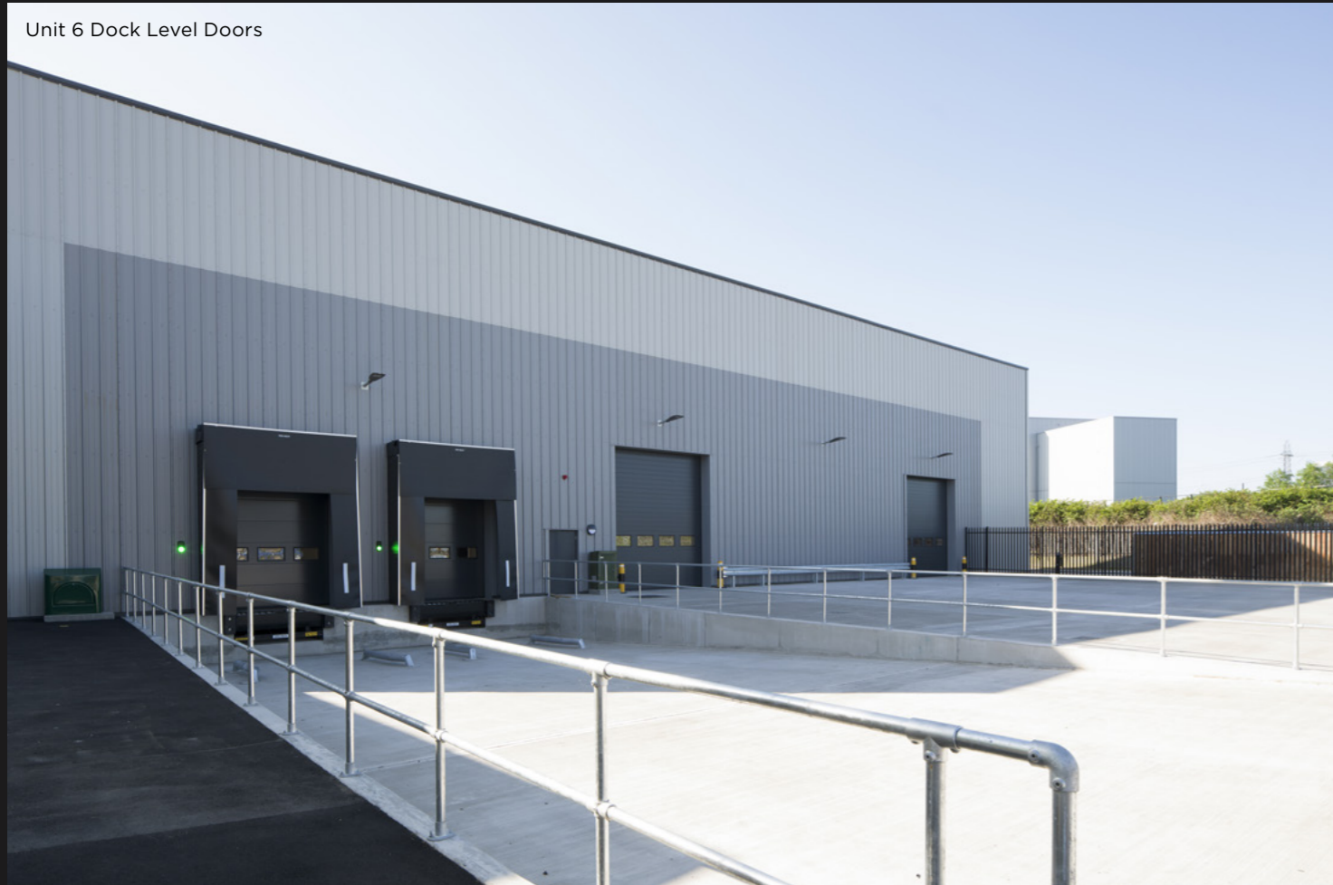
Unit 6 Dock Level Doors