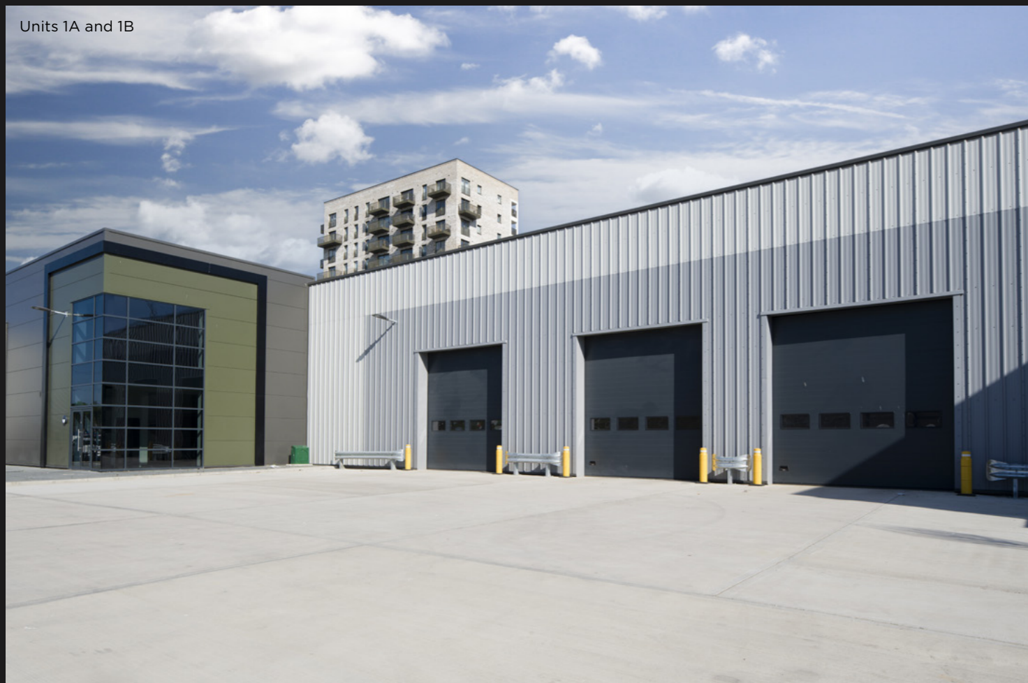
Units 1A and 1B