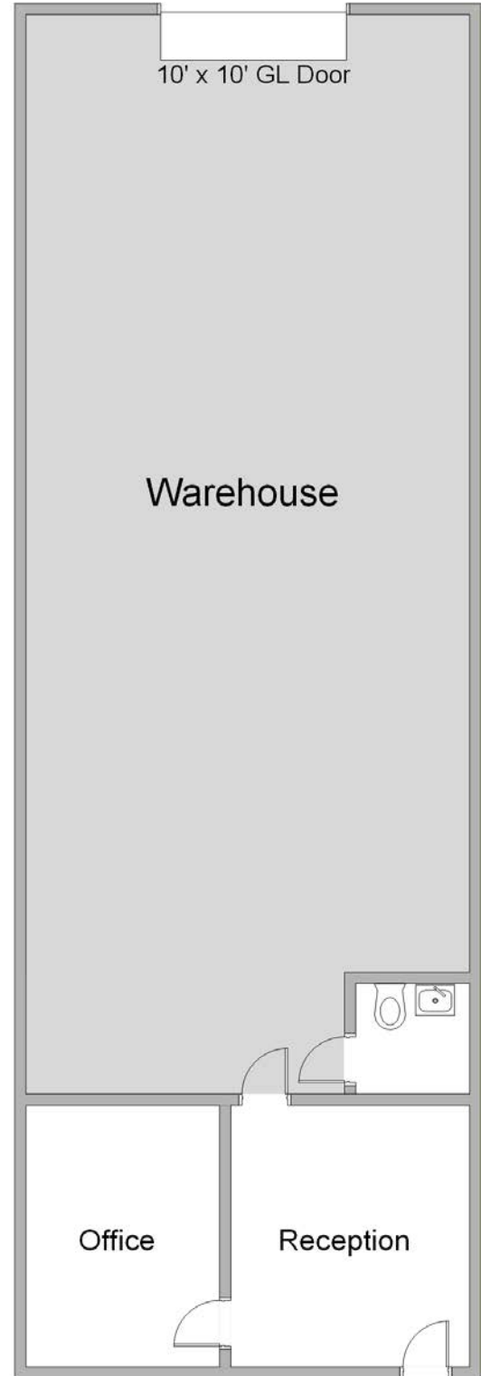
*Floorplans Not to Scale