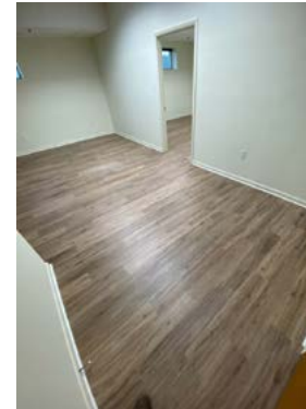
SPEC SUITES 215/217