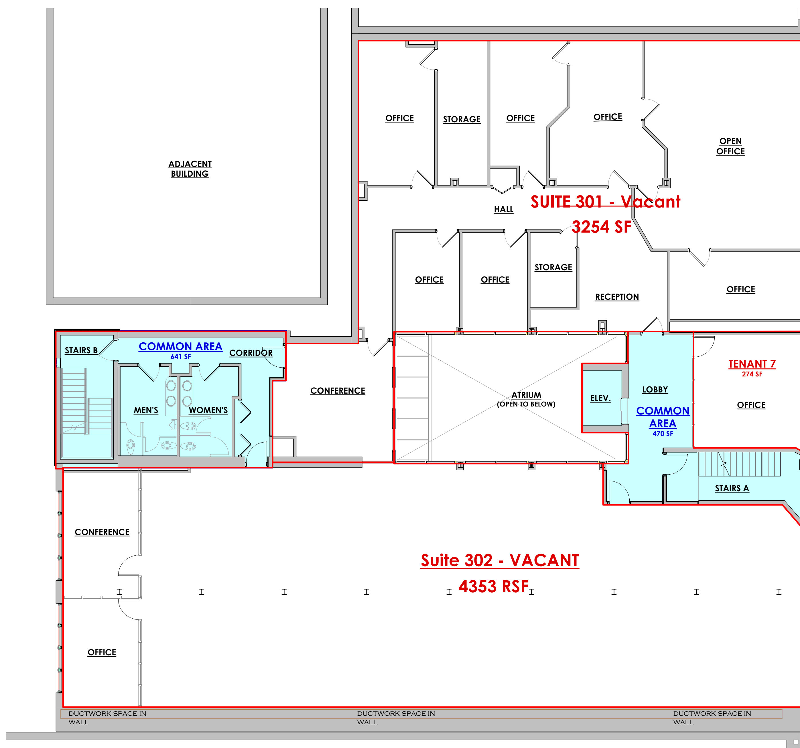
3RD FLOOR PLAN 1/8" = 1'-0"