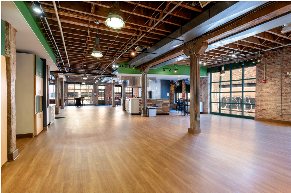
Open Dining Space