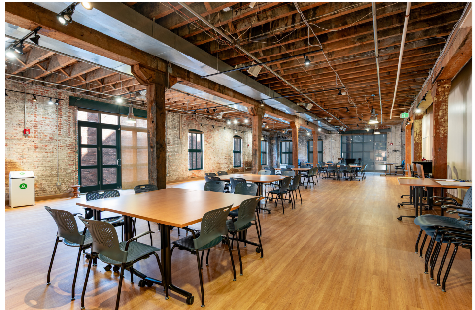
Event Seating Area