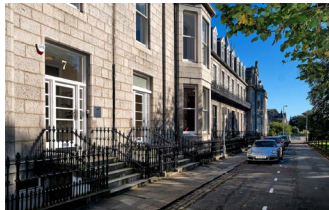
7 QUEEN'S GARDENS