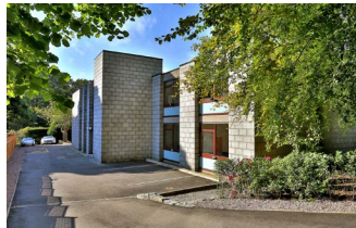
23 RUBISLAW DEN NORTH

7 Queen's Gardens Aberdeen AB15 4YD Scotland