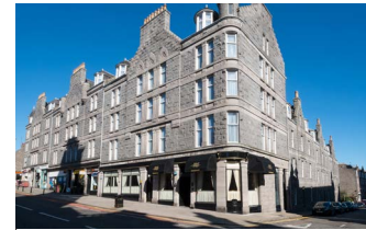
96 ROSEMOUNT VIADUCT

23 Rubislaw Den North Aberdeen AB15 4AL Scotland