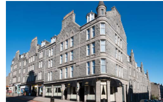
96 ROSEMOUNT VIADUCT

23 Rubislaw Den North Aberdeen AB15 4AL Scotland