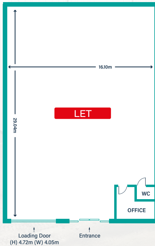
Unit 2 5,033 sq ft (467.54 sq m)