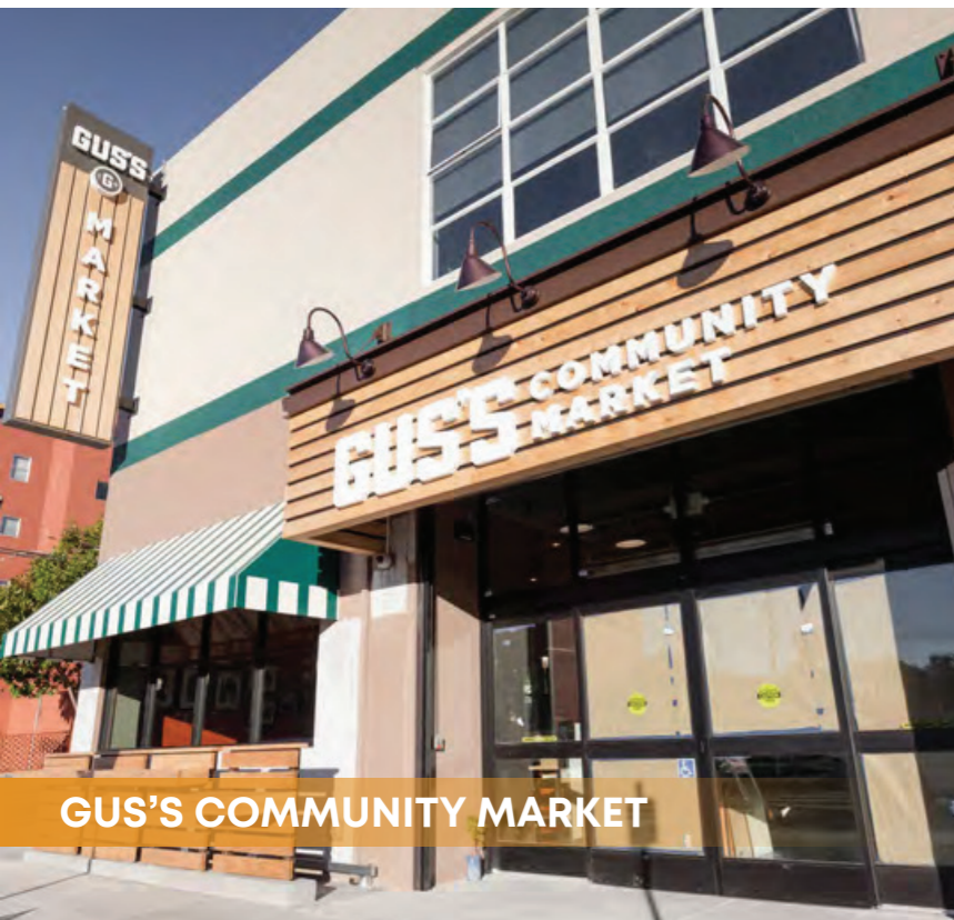
GUS'S COMMUNITY MARKET