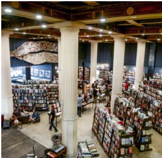
📍 LAST BOOKSTORE