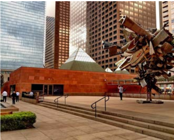
📍 MOCA MUSEUM