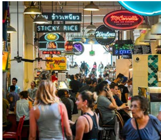
📍 GRAND CENTRAL MARKET