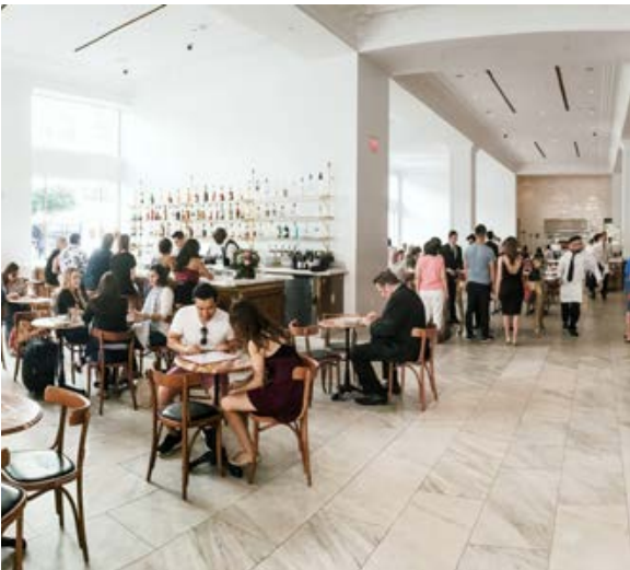
📍 BOTTEGA LOUIE