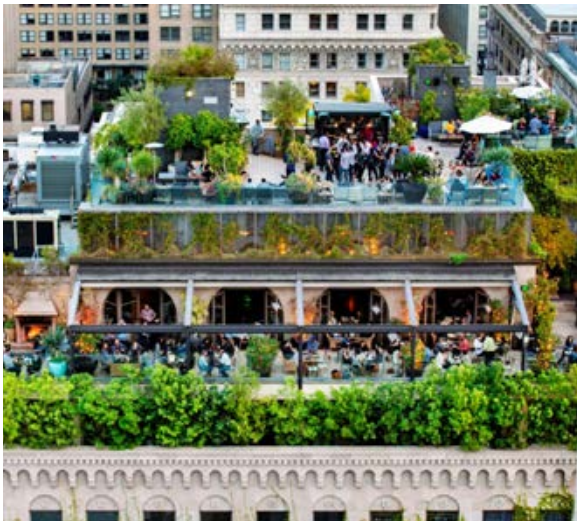
📍 PERCH LOS ANGELES