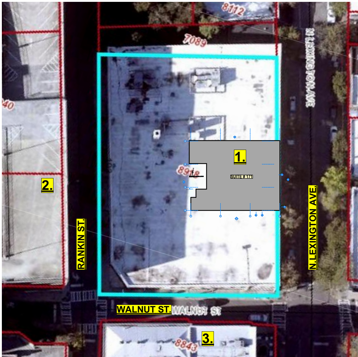
Site Plan 1" = 50'